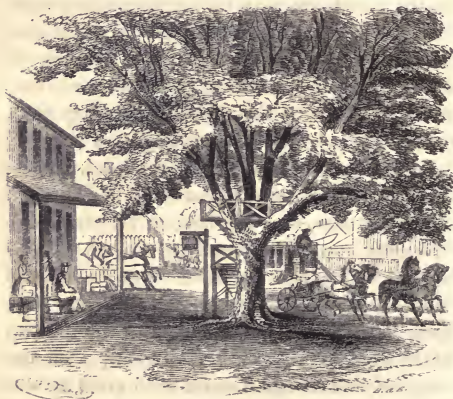
THE GREAT ELM.

There was a very large elm-tree before the door, with steps to climb up, and seats among the branches. Marco went up there and sat some time, looking down upon the coaches as they wheeled round the tree, in coming up to the door. Then he went down to the piazza again.